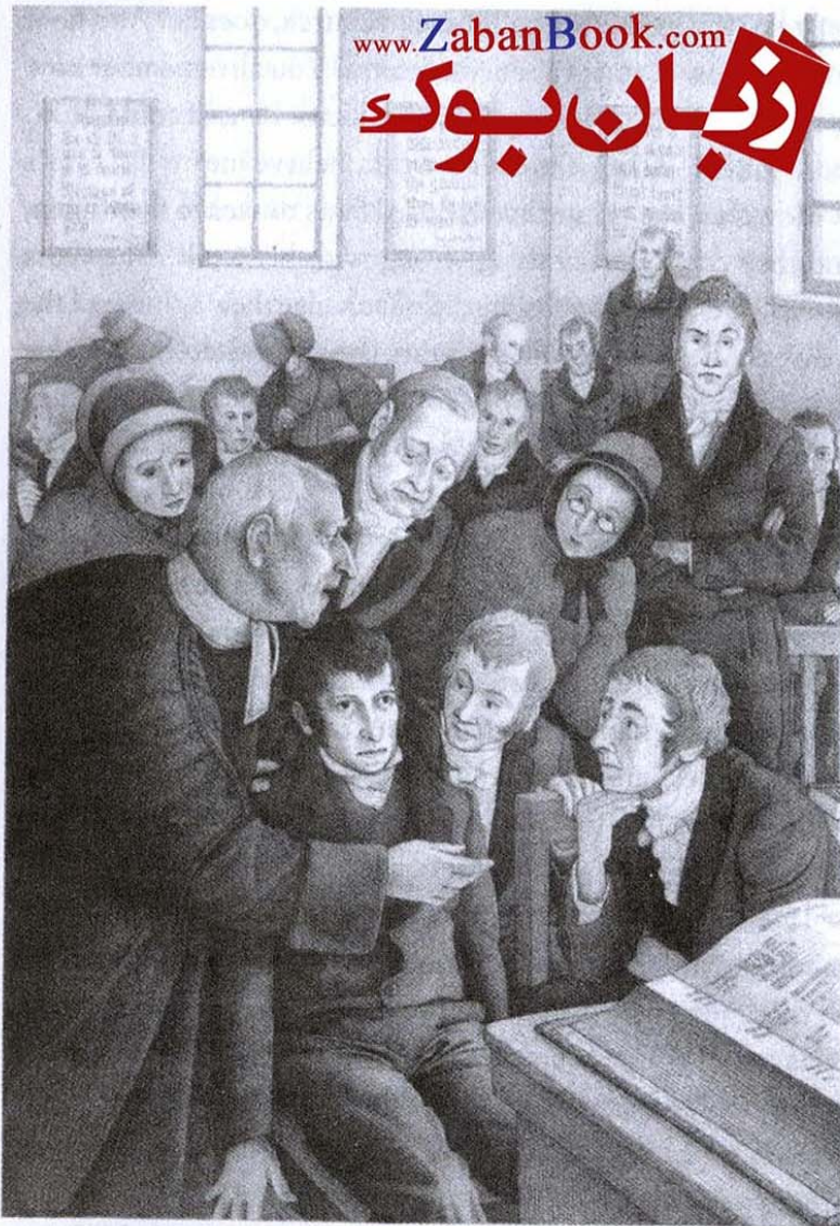
Once, at a chapel meeting, Silas had been unconscious for over an hour.

good friends, when Silas became engaged to a young woman, Sarah, who belonged to the same chapel. In fact Silas was delighted that Sarah did not mind if William joined them sometimes on their Sunday walks.